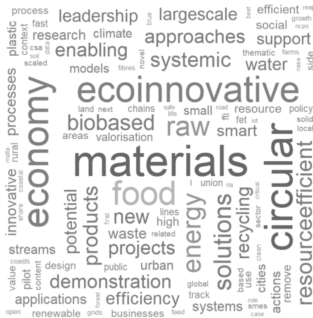
Figure 1: Word cloud of key terms in EU H2020-Funded CBE Projects